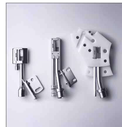
Easily retrofittable to all tablet presses