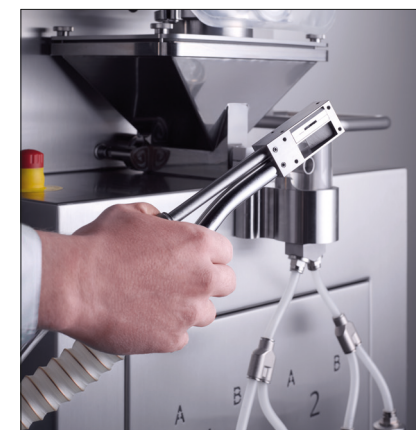
Unique & compact spraying design