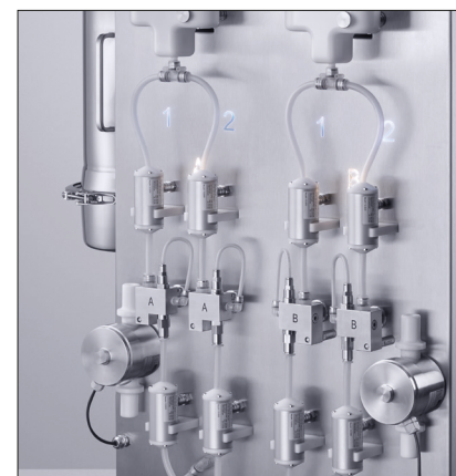
Back-up line secured by a continuous pressure monitoring