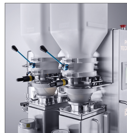
Dust tight dispensing system